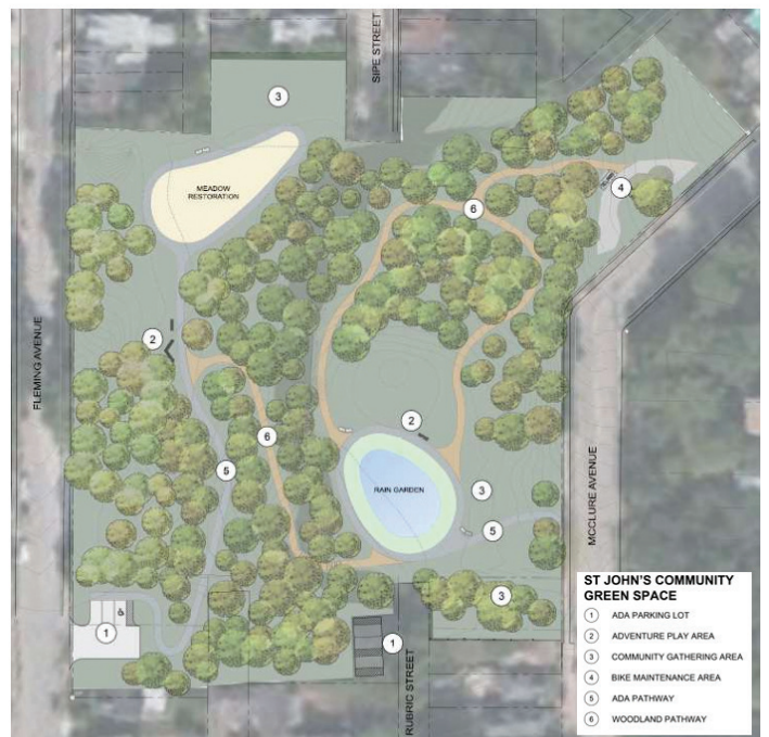
IMAGE 1. CONCEPTUAL DRAWING FOR ST. JOHN'S GREEN SITE REDEVELOPMENT IDENTIFYING MAJOR NEW FEATURES.